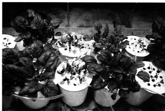
Fig. 1a. Spinach hydrocultures photographed on December 1986 (shortly before cropping). The silicon and boron concentrations applied were 25 ppm and 0.3 ppm, respectively. The used symbols signify: O = no herbicide, S = Stomp, D = Dicuran, T = Tribunil. Each attempt was run twice.

The chloroplast activity of the different samples was measured using the Hill reagent K_3 [Fe(CN)_6] [33].