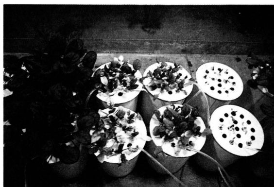
Fig. 1b. Spinach hydrocultures photographed on December 1986 (shortly before cropping). The silicon and boron concentrations applied were 50 ppm and 0.6 ppm, respectively (symbols: see Fig. 1a). Each attempt was run twice.